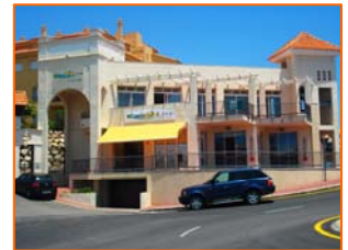
Head Office, Riviera del Sol, Mijas Costa, Costa del Sol

are usually 30% deposit and then the remaining 70% on signing of the title deeds. The appointed lawyer will carry out all necessary searches on the property; to ensure that it is owned by the vendor and there is planning permission